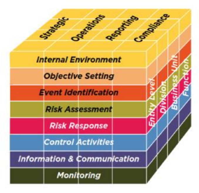
COSO ERM Framework

COSO's guidance illustrated the ERM model in the form of a cube. The cube illustrates links between objectives that are shown on the top and the eight components shown on the front, which represent what is needed to achieve the objectives. The third dimension represents the organisation's units, which portrays the model's ability to focus on parts of the organisation as well as the whole.